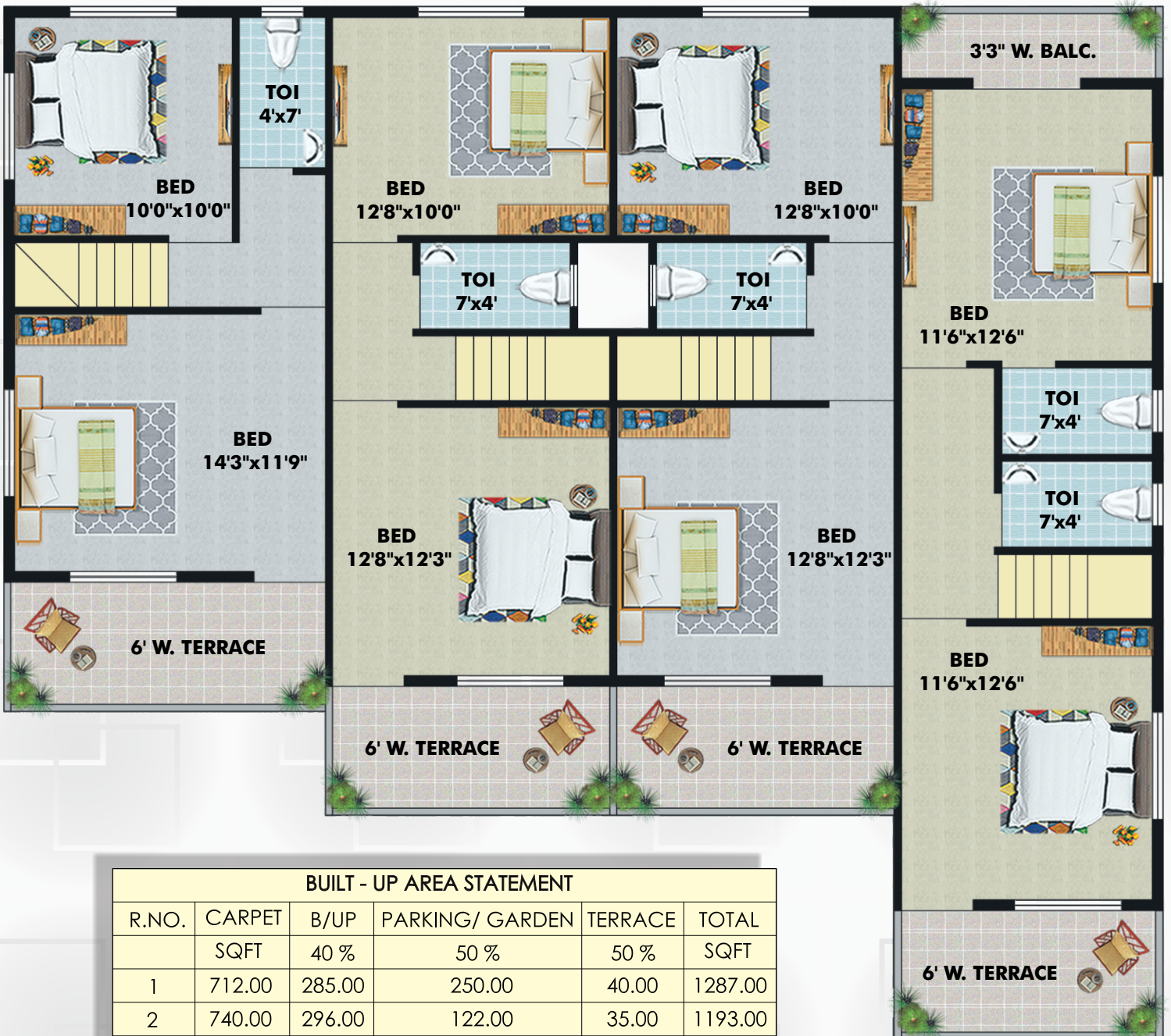
BUILT - UP AREA STATEMENT